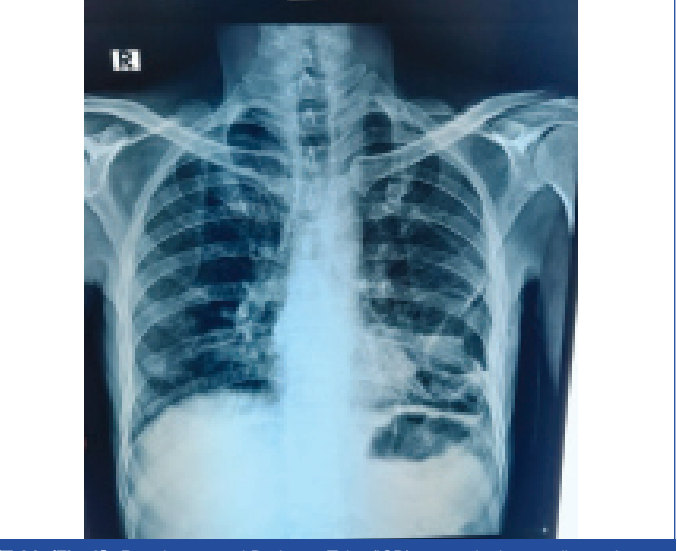
[Table/Fig-6]: Post Intercostal Drainage Tube (ICD) removal, chest radiograph on day 12<sup>th</sup> of admission shows resolution of earlier radiological findings along with lung expansion on left-side.

Post-discharge patient reported improvement in general health, appetite and well being on telephonic consultation. Patient was advised to follow-up in a non-COVID-19 medicine OPD with regular monitoring of haemogram, liver and kidney function tests. Written informed consent was obtained from the patient for this study.